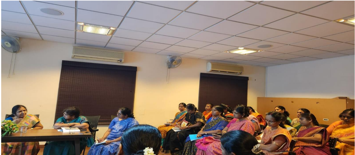
Date: 22/7/2023 E Talk on 'My Entrepreneurial Journey'