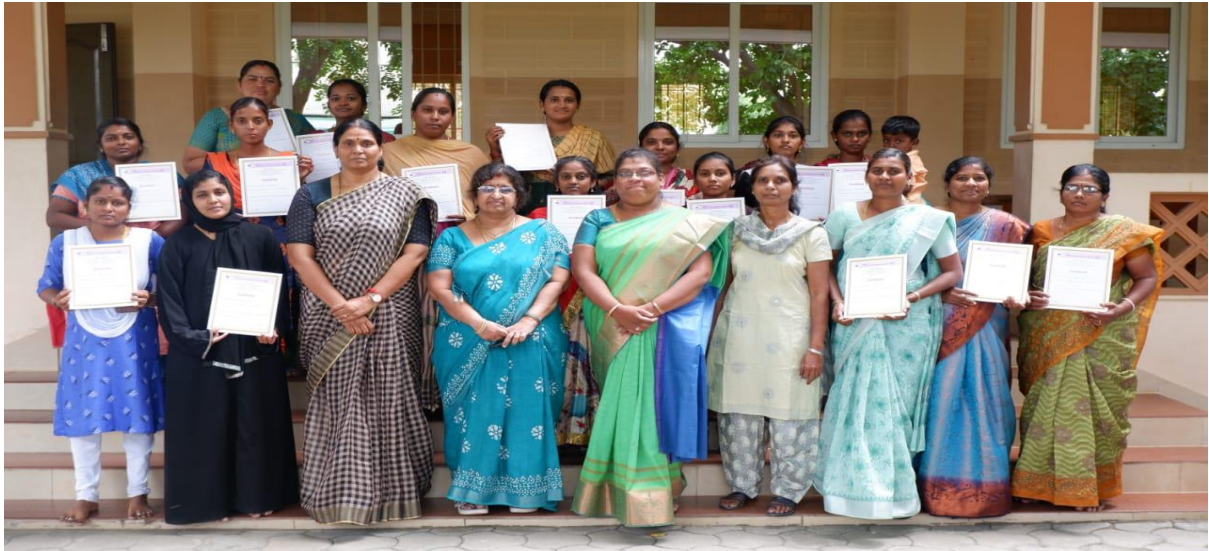
Date: 10/07/2023 Industrial Visit and Bakery Training